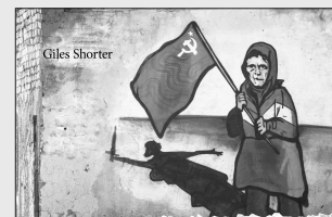
Neo-nazi Nato's Proxy War Against Russia