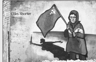
Neo-nazi Nato's Proxy War Against Russia